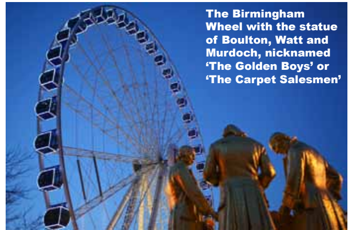
The Birmingham Wheel with the statue of Boulton, Watt and Murdoch, nicknamed 'The Golden Boys' or 'The Carpet Salesmen'

• Poppy Red's chocolate and raspberry fondant is to die