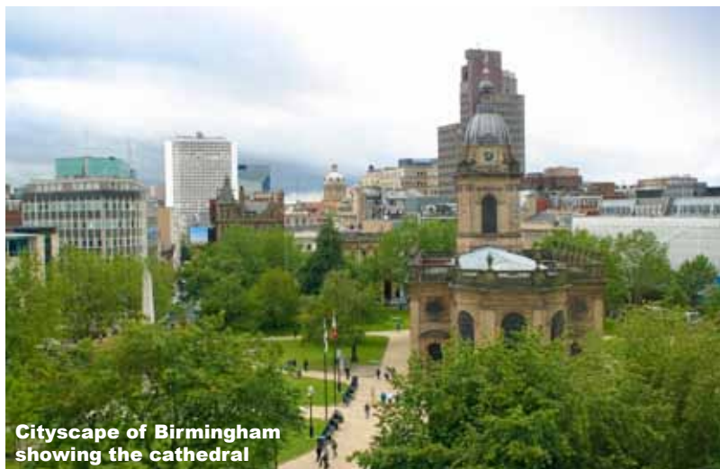
Cityscape of Birmingham showing the cathedral

Centuries ago the people of Birmingham used to bait bulls with dogs for fun. Apparently it made the animals' meat more tender. Now their main occupation on a Saturday seems to be shopping or sipping coffee in the Bull Ring, the swish new centre built around the spot where the bulls were once tethered.