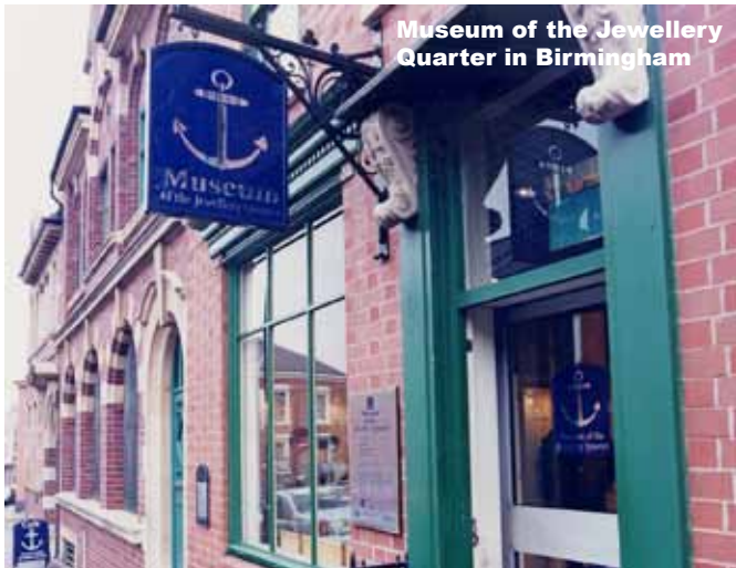
Museum of the Jewellery Quarter in Birmingham

and weathermen recorded a bulletin which they could later download from the website to show their friends.