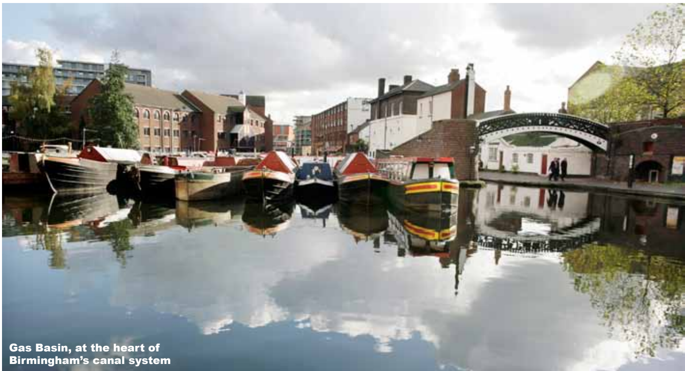
Gas Basin, at the heart of Birmingham's canal system